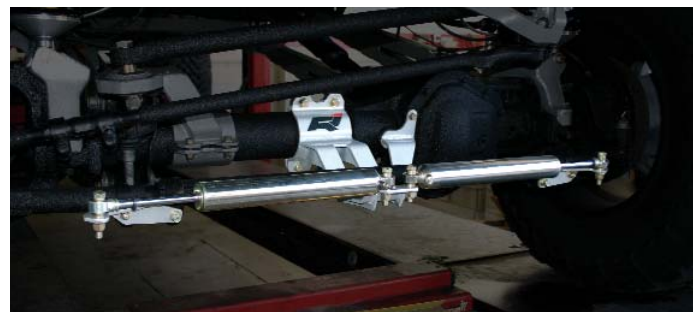
Rize bracket with Tuff Country stabilizers