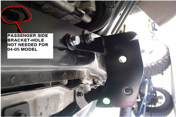
FIGURE 4 - HOOD OPEN –RIVETS NEED TO BE REMOVED