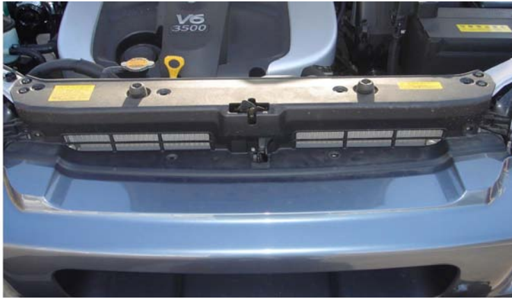
FIGURE 5- HOOD OPEN – AFTER