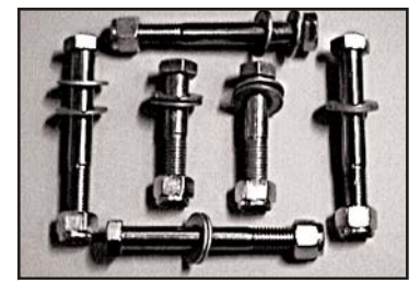
This photo is not necessarily an actual photo of your spring eye bolt kit. Lengths and quantity may differ.