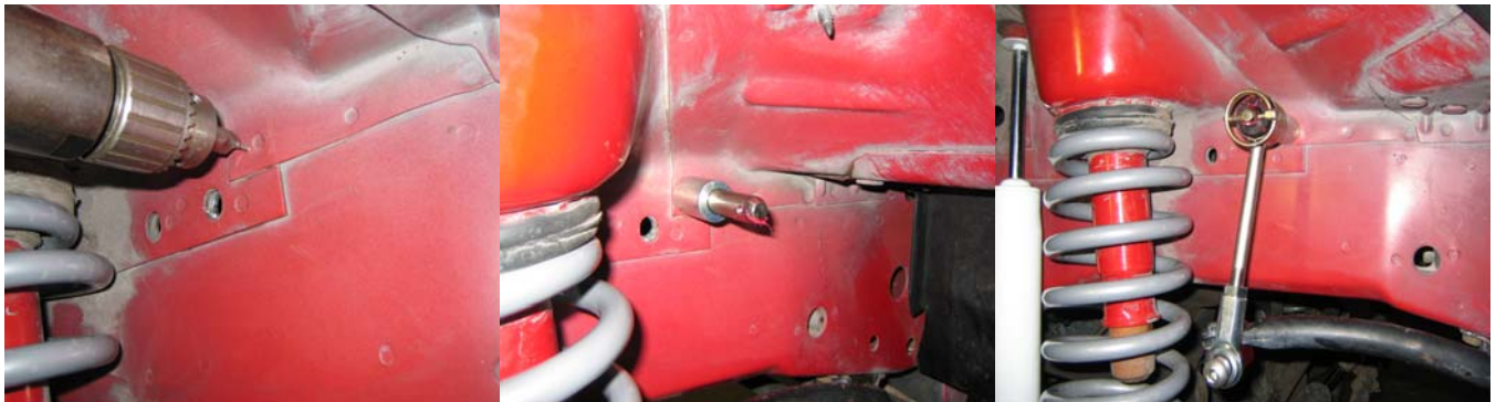
PICTURE -B- MOUNTING PIN HOLE LOCATION & MOUNTING ORENTATION FOR ALL XJ & ZJ'S, W/O RE SWAY BAR RELOCATION BRACKETS (P/N RE9921)

NOTE- ABOVE IMAGE SHOWS 11" DISCONNECTS (P/N RE1142, FOR 4.5-5.5" LIFTS) FOR 2-3.5" LIFTS, 9" DISCONNECTS ARE USED (P/N RE1141), MOUNT PIN APPROX 2" FORWARD FROM ABOVE POSITION FOR 0-2" LIFTS, 7" DISCONNECTS ARE USED (P/N RE1140), MOUNT PIN APPROX 4" FORWARD FROM ABOVE POSITION