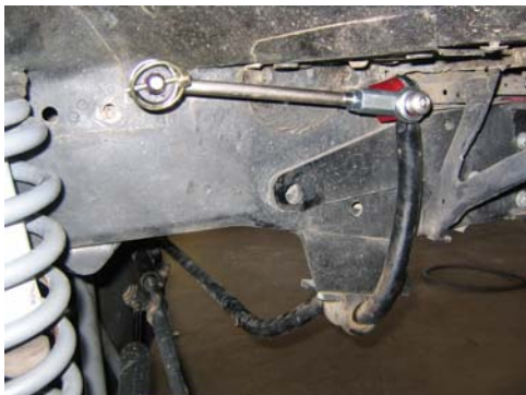
MOUNTING ORIENTATION FOR ALL XJ & ZJ'S WITH RE SWAY BAR RELOCATION BRACKETS (P/N RE921)