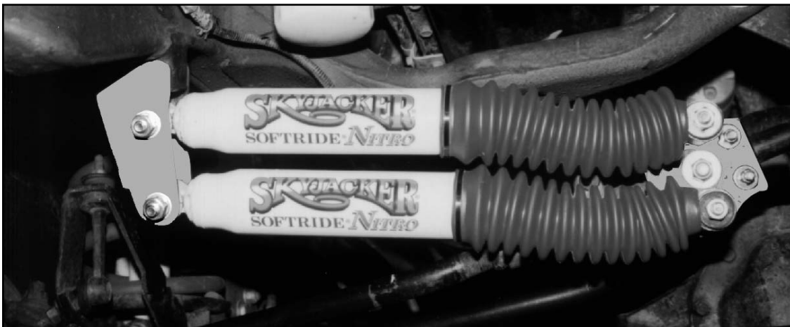
Dual Steering Stabilizer Available, #7217