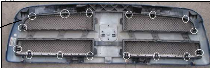
Figure 3 – Rear view of vehicle's shell; Grills attached with Metal Brackets and Flange Nuts