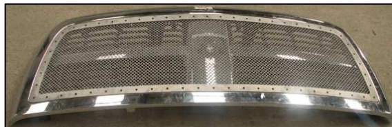
Figure 2 – Front View of positioning Grille