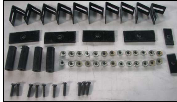
Figure 1 – Included Hardware