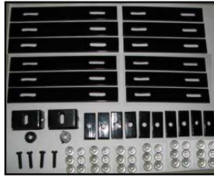
Figure 1 – Included Hardware