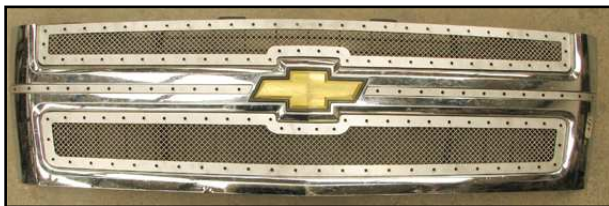
Figure 2 – Front View of positioning Grille