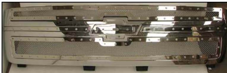
Figure 2 – Front View of positioning Grille