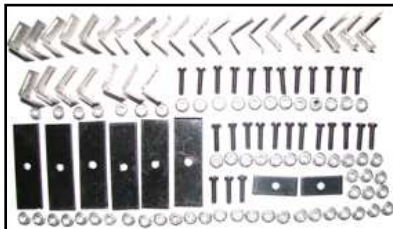
Figure 1 – Included Hardware