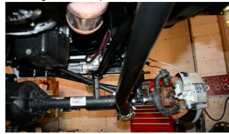
Revised 03 September 2008