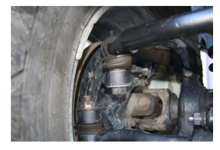
45. Reinstall the breather hose if it was disconnected during disassembly.

44. Remove the factory draglink at the steering knuckle. Loosen the adjuster sleeve and remove the long side of the drag link. The threads will be left hand so you will need to turn it opposite of way you might be used to. Install the new heavy flip drag link into the adjuster sleeve and set the length to 41 ¼". The flip drag link is installed from the top down on the knuckle. To convert the taper, a sleeve is provided. To install the sleeve you must drill out the knuckle to a 13/16" hole. Drilling the knuckle straight is very important. After you have drilled the hole, install the sleeve, you may need to tap it into place, from the top down. Install the new heavy flip drag link. Use the provided washer and tighten the nut over the washer.