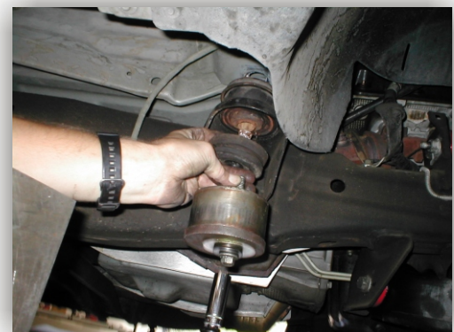
Remove body mounts.

NOTE: If you are having trouble removing the lower body mounts, use a larger washer and a deep sleeve to fit over the lower mount and tighten the factory bolt back into the upper body mount from under the truck. This will act as a puller device to remove the lower body mount. (See picture at right)