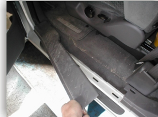
Remove trim panels.