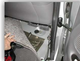
Lift back carpet in passenger area.