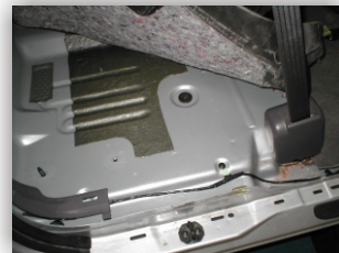
Lift back carpet in extended cab.