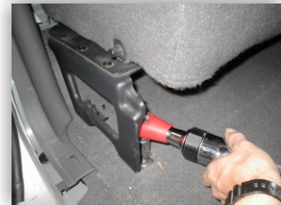
Remove rear seat bolts.