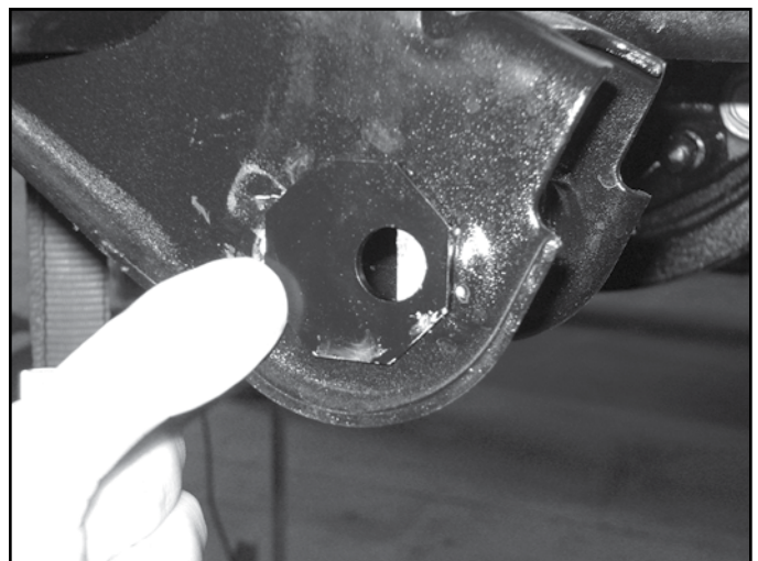
Fig. 1B - Shows Max. Caster Position