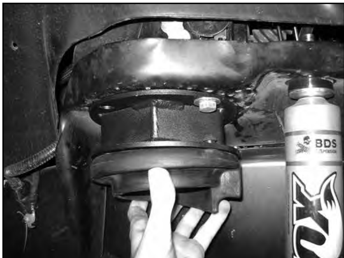
FIGURE 4A - DRV