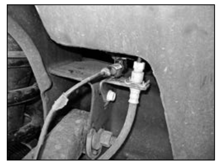
FIGURE 1A FIGURE 1B