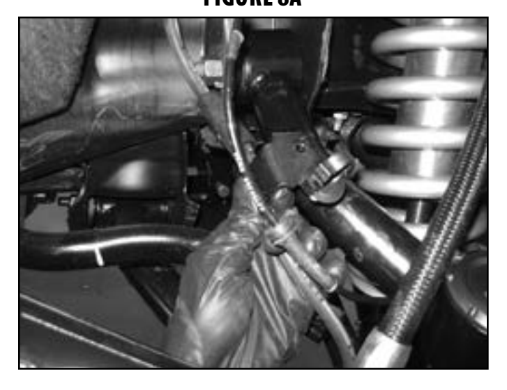
FIGURE 8A FIGURE 8B

16. Attach modified factory brake line bracket to the upper control arm with ¼" hardware. Tighten to 12 ft-lbs. Cycle the steering to ensure that the brake line clears the sway bar components. Rotate bracket if necessary. (Fig 8a, 8b)