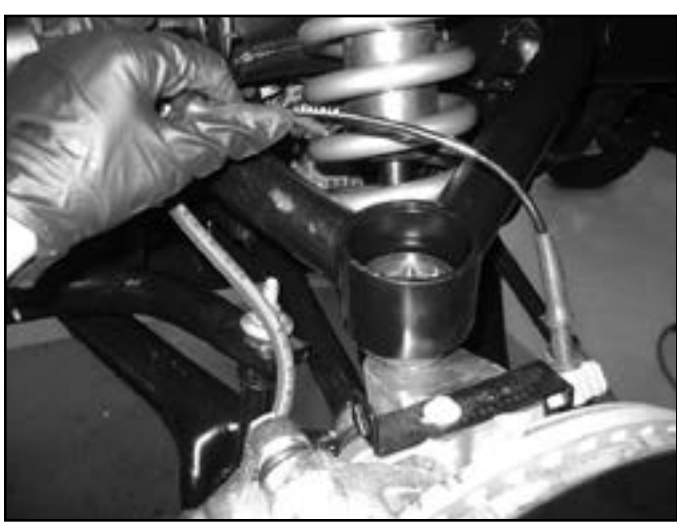
FIGURE 7A FIGURE 7B