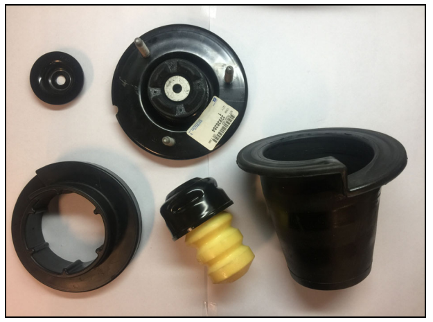
Fig 2: 2014+ OE GM 1500 and 2015+ Tahoe Top Mount Components