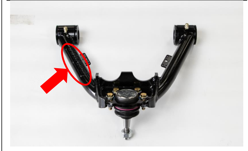
Figure 2: Top of control arm: Grease fittings and Logo facing up.