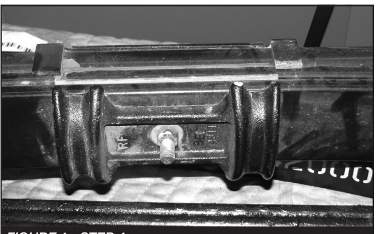
FIGURE 1 - STEP 4