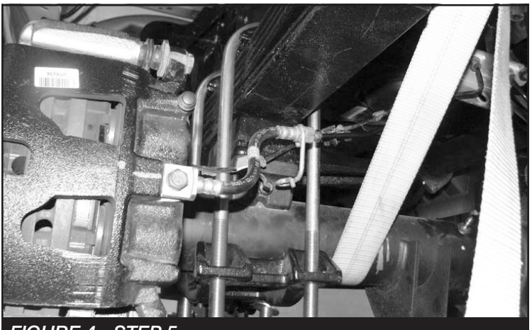
FIGURE 4 - STEP 5

Install the new leaf spring into the original spring location using the factory shackle and hanger bolts. Torque to 148 ft-lbs. Use the supplied u-bolts to secure the new leaf spring to the axle. NOTE: The factory block will be reused in the factory location. Torque the u-bolts to 179 ft-lbs. SEE FIGURE 4