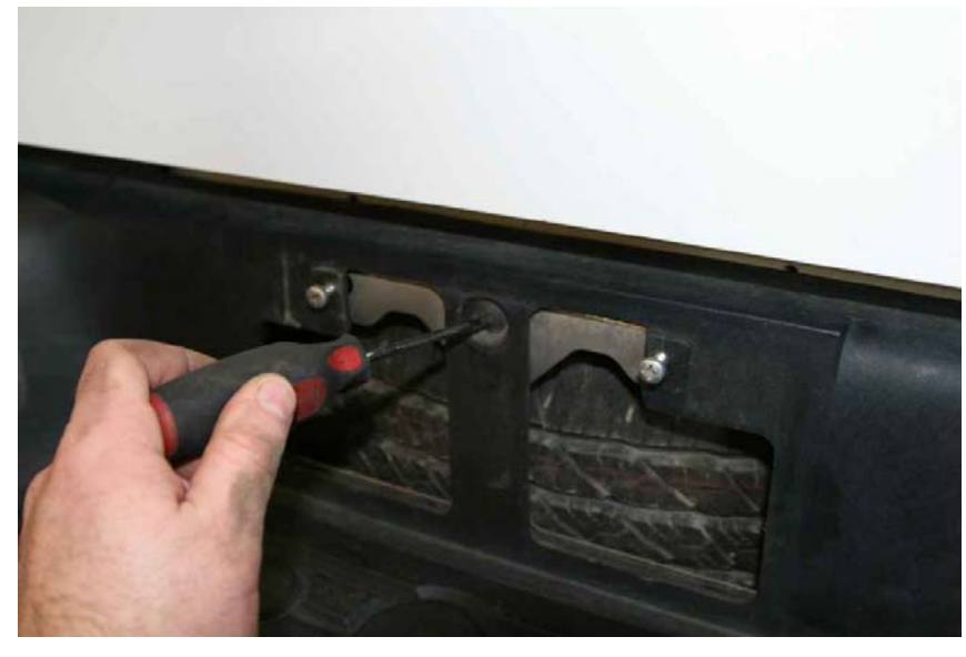
E. Pop the plastic clips loose on the bottom side of the main piece of plastic on the top side of the bumper allowing access to the OEM fasteners.

D. Remove the Phillips head screw passing through the plastic that was hidden by the license plate previously. See Image Below.