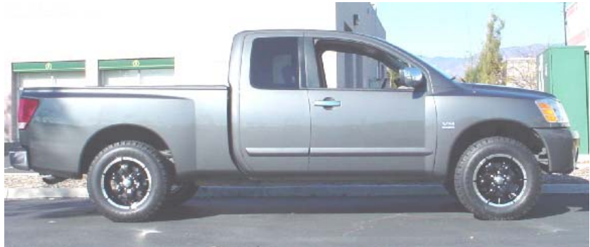
Nissan Titan with ReadyLift ® and 295 / 70x17 tires installed on 17x8.5 wheels with 4.5" backspacing

*Adjust your headlights whenever your vehicle's ride height is altered.