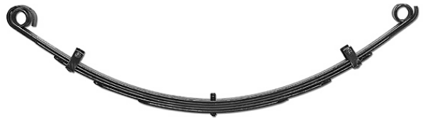
< FRAME END (MILITARY WRAP) - PHOTO 2 - SHACKLE END >