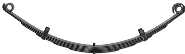
< SHACKLE END – PHOTO 6 – FRAME END (MILITARY WRAP) >

Caused by a steep drag link angle on CJ's. Installing a drop pitman arm may help.