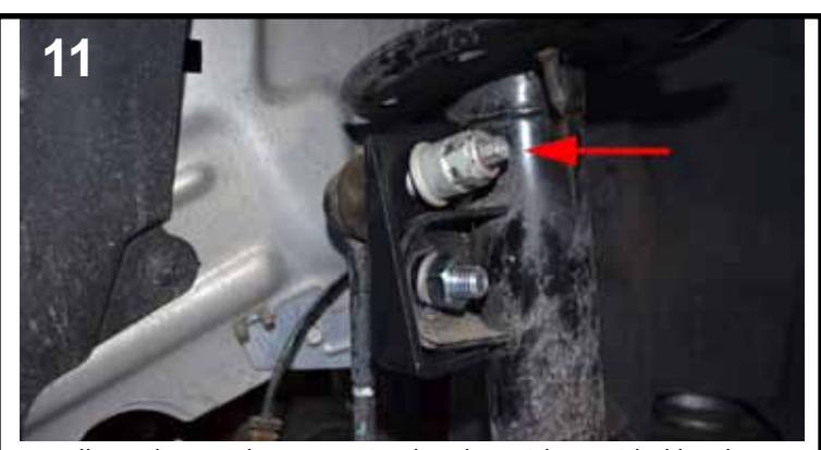
Install Traxda sway bar extension bracket with provided hardware. Tighten the sway bar end link to the Traxda bracket.

Check all hardware is mounted at correct torque settings. Recheck all work, and reinstall wheels. Once back on the ground, have a trained technician perform an alignment.