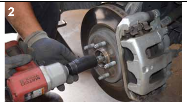
Loosen & remove the axle nut, and push the axle through the spindle.