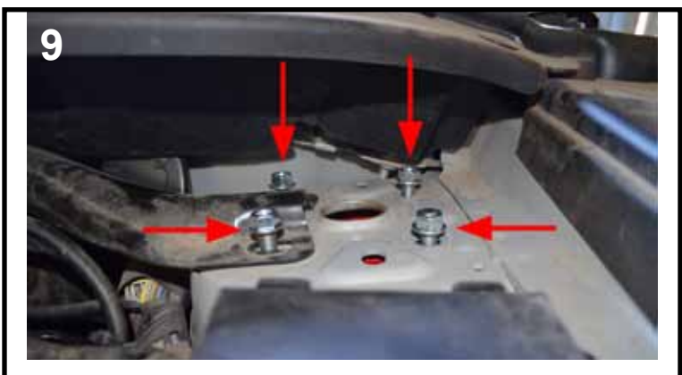
Reinstall upper strut mounting nuts. Do not tighten fully.