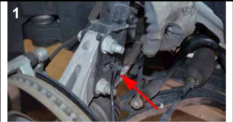
Raise vehicle on jack stands and remove wheels. Disconnect the ABS and brake hose.