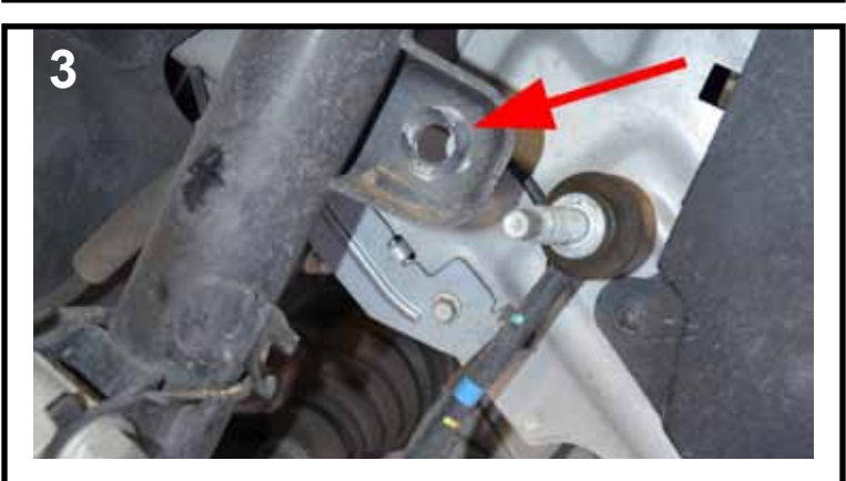
Disconnect sway bar end link from strut.