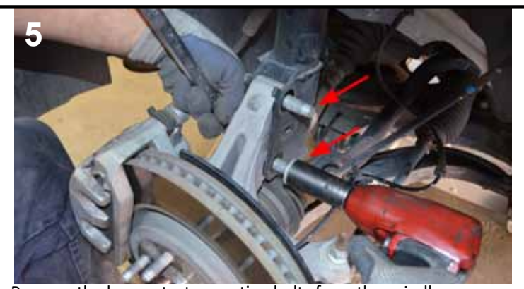
Remove the lower strut mounting bolts from the spindle. you may need to carefully tap the bolts with a hammer to fully remove them.