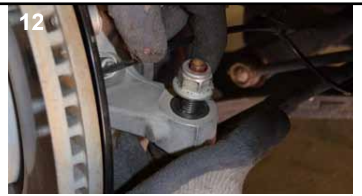
Re-tighten the axle nut, reinstall the tie rod (above) and the ABS/ brake lines.