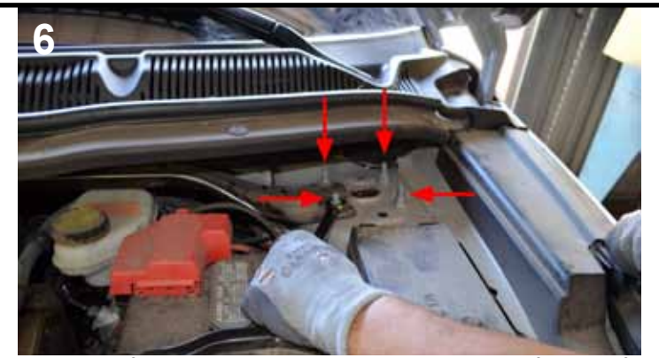
Remove nuts from upper strut mount. Support weight of strut before removing final nut. Remove strut from vehicle.