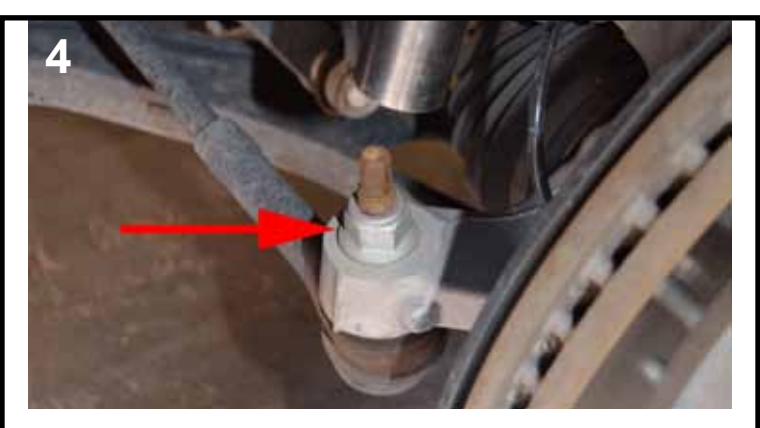
Disconnect tie rod end.