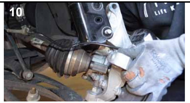
Reinstall lower strut mounting bolts while guiding axle through the spindle. Tighten all strut nuts fully, upper and lower.

Check all hardware is mounted at correct torque settings. Recheck all work, and reinstall wheels. Once back on the ground, have a trained technician perform an alignment.