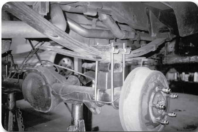
Rear Block Kit