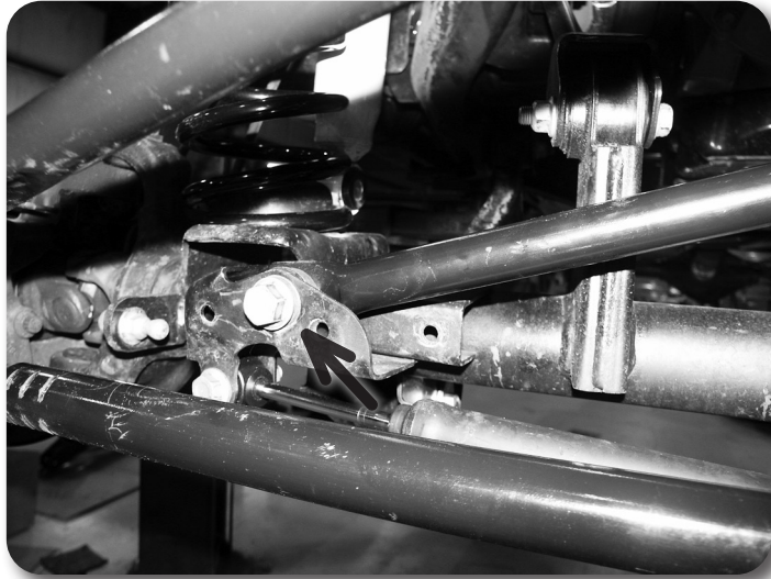
Figure 1 - LHD (Left Hand Drive) Shown