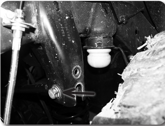
Figure 3 - LHD Shown