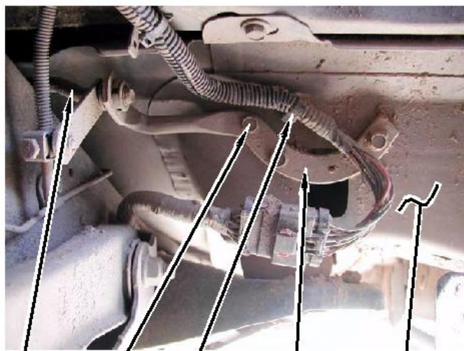
Pivot Shaft Bolt Wire Harness Clip Pivot Shaft Support Arm Cab Floor

Transfer case (1994-97) Remove the cap from the knob on top of the transfer case (4WD) shift lever. Loosen the nut that secures the knob to the shift lever. Remove the screws that secure the shift boot to the floor. Remove the shift boot. Remove the nut that secures the transfer case shift linkage rod to the transfer case. Remove two