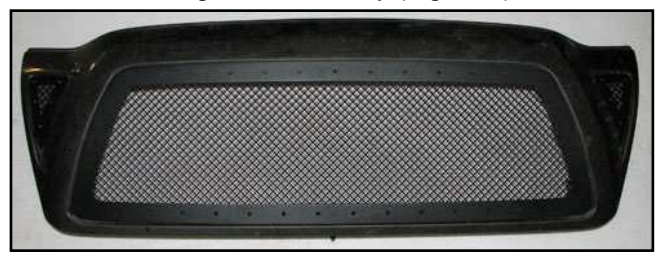
Figure 2 – Front View of positioning Grille