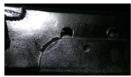
NOTE: Make the tack welds about 1 1/2 inches long.