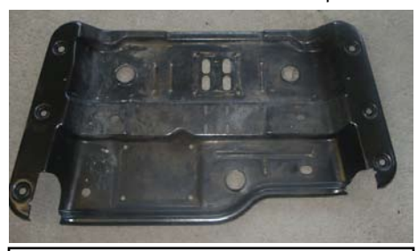
Typical skid plate modifications necessary on '97-'02 vehicles.

10. 2003-current TJs: The 2003 and newer TJ skid plate's sit closer to the rear of the TJ than previous models, this requires more extensive trimming of the factory skid plate than 97-02 models.