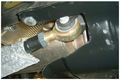
Typical skid plate modifications necessary on '03-current vehicles.

10. 2003-current TJs: The 2003 and newer TJ skid plate's sit closer to the rear of the TJ than previous models, this requires more extensive trimming of the factory skid plate than 97-02 models.